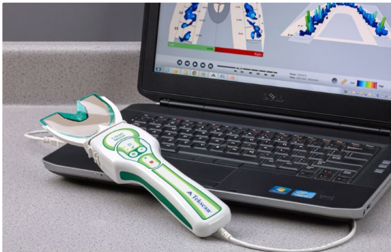
Figure 3: The T-Scan 10 Novus recording handle loaded with a Novus HD sensor, that is connected via USB to the T-scan 10's companion, color-coded force and timing software

that occlusal data with the marking of teeth with thin articulating paper (Accufilm 23 micron, Parkell, Inc., Farmingdale, NY, USA), to isolate the data-determined problem contacts. Because the T-Scan sensor does not mark the teeth, thin articulating paper is required to make targeted occlusal adjustments of the problem contacts, where only the data-determined problem contacts are adjusted, regardless of the appearance characteristics of the neighboring articulating paper marks. In this combined method, all healthy low force occlusal contacts are left untreated, which dramatically improves the outcomes of any T-Scan guided occlusal adjustment procedure.